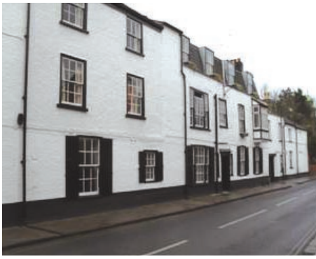
Farrer House, Eton