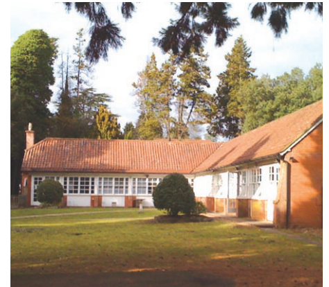
Above: Stonemasons Court, Brookwood, Guildford